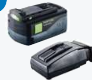
BAT143 & BAT145